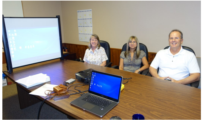
Training Session on new RCAMS 10 Version

In the past few years, Intersect has expanded its use of remote connections for customer training and support with software tools such as Join Me and Team Viewer, providing direct online screen-to-screen interaction between Intersect support and a customer's system, as well as allowing convenient online software updates. This alternative for remote support and updates has helped Inter-