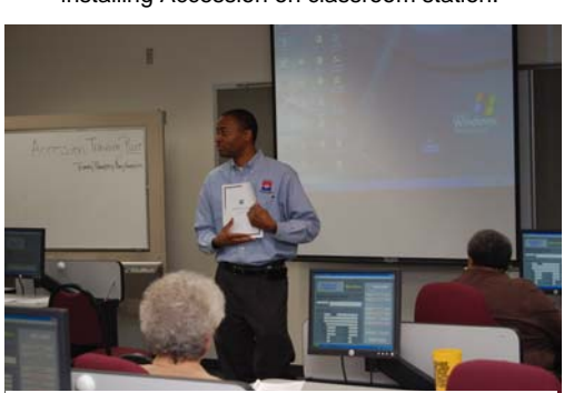
Prototype Accession Training Class session in progress in DCCCD classroom.